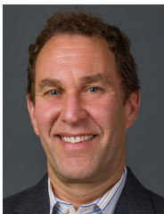
Jeffrey Mogil, Ph.D.

Pain, of course, has a protective function. It helps us avoid injury by prompting us, often involuntarily, to withdraw from potentially damaging stimuli—by dropping a hot pan, for example. However, neuropathic pain, which is often chronic and can occur after damage to the nervous system, is a disease condition that has no protective role. Although glia play no part in transmitting normal pain signals, recent research has implicated glial cells in chronic neuropathic pain conditions—for example, those emerging after injury or surgery.